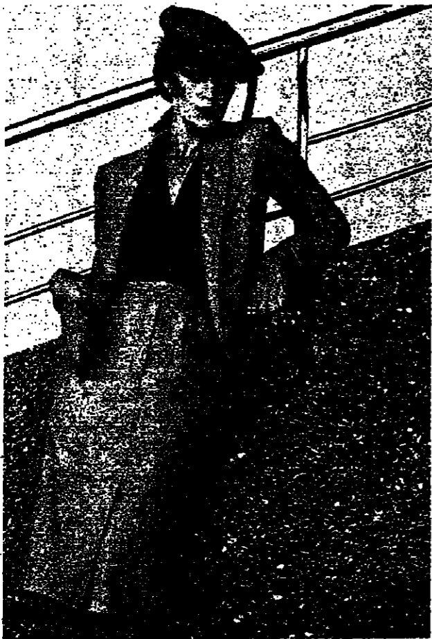
Straight-jacket and skirt (above) by Riki Ben-Ari; long narrow coat by Gideon Oberson (below).